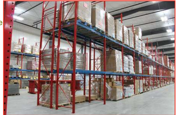
New racking in expanded warehouse space

What has really made our journey over the past year amazing are the people who are part of it. We are blessed with wonderful staff, fantastic agency partners, generous donors and incredible volunteers – over 2,300 this past fiscal year – who walk with us on this journey. But the really special part of this journey are our clients...the little boy whose eyes lit up when his mom handed him a fresh apple to eat that she had just received in our food shelf. Or the senior who wiped away tears as a volunteer helped her load her cart with enough food to fill her pantry. Or the single father who was able to take a deep breath and stand up tall, knowing he now had enough food to feed his two kids until his next payday. Those individuals are the key to our journey. We are grateful to them for the trust they place in us, and we are grateful to you for providing the resources necessary to fulfill that trust.