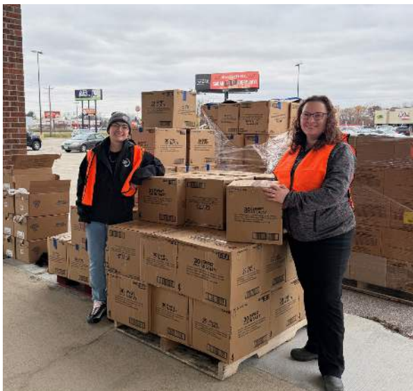
Photo from SNAP Box distribution at Family Services Rochester

Within days, Channel One identified six partner distribution sites, Think Bank, Stewartville High School, Family Service Rochester, American Legion Post 551 in Byron, Graham Park, and Gage East. With the help of 21 different volunteer groups working back-to-back shifts for 3 days leading up to the distribution, Channel One packed boxes of shelf stable items and boxes of fresh produce, milk, eggs and protein. On Friday, November 7th, staff and volunteers mobilized at the six different sites ready to distribute food to over 2,500 households in Olmsted County. This effort could not be possible without the strong partnerships and relationships that Channel One has with not only the distribution sites, but also with the county, the residents, and the other crucial non-profits that serve our neighbors. The dedication of this community is always clear in times of crisis, and Channel One is tremendously grateful to all that were involved in this monumental effort.