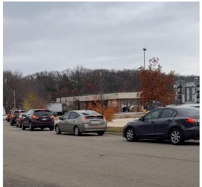
Photo from SNAP Box distribution at Family Services Rochester

This past October and early November brought about extra stress for our food insecure community and communities around the nation. The longest government shutdown in history meant government employees were not receiving paychecks and SNAP benefit uncertainties resulted in more people turning to food shelves at a time when hunger relief programs were already stretched thin. The rapid increase in need was too much for many food shelves in Channel One's region and put them at a food deficit heading into the holiday season. Thankfully Channel One received $180,000 from Olmsted County to hold a one-time food distribution targeted for those who were under threat to lose SNAP benefits. The initiative came together quickly as Channel One worked alongside county workers and partner non-profits to ensure our neighbors had enough food to eat.